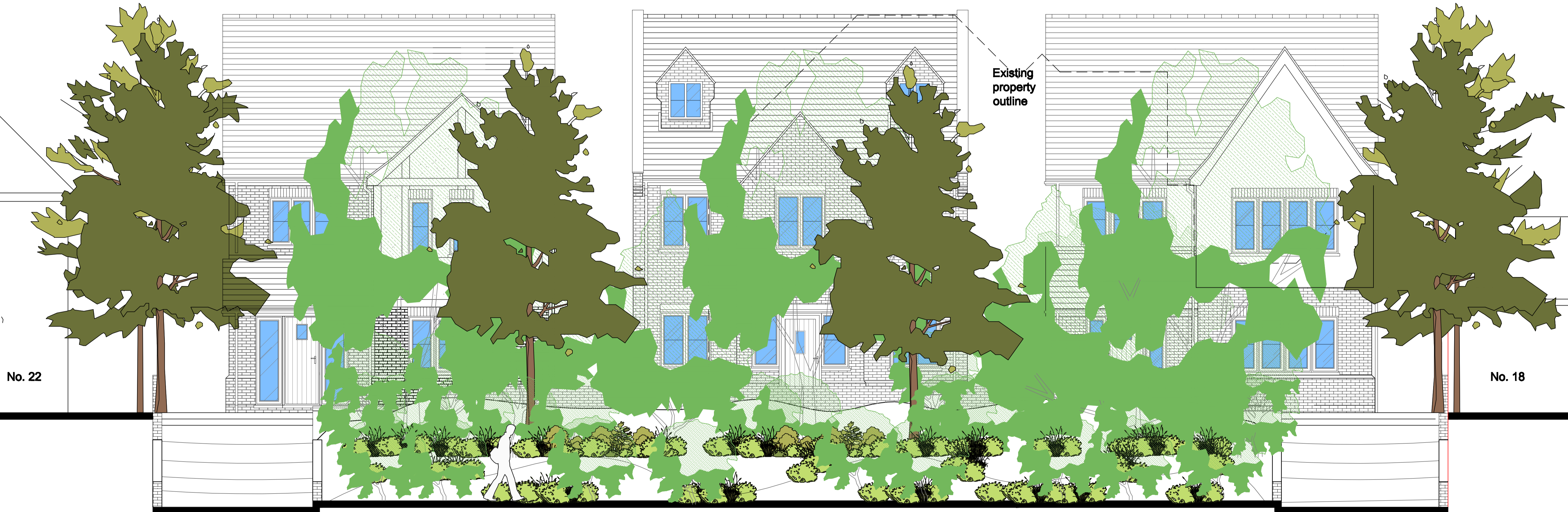
PROPOSED DEVELOPMENT STREETSCENE ELEVATION ( WITH GARAGES)